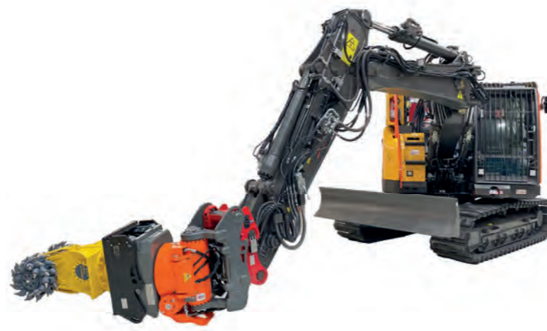
Laterally adjustable offset-boom