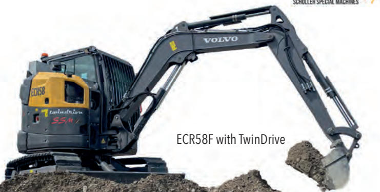
ECR58F with TwinDrive