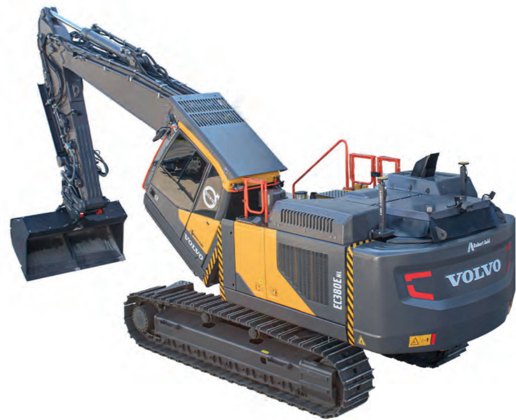
Tilttable cab and straight boom