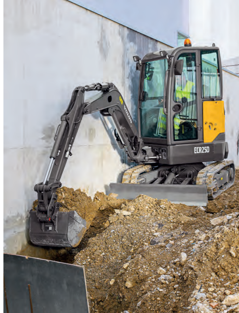
Volvo compact machines