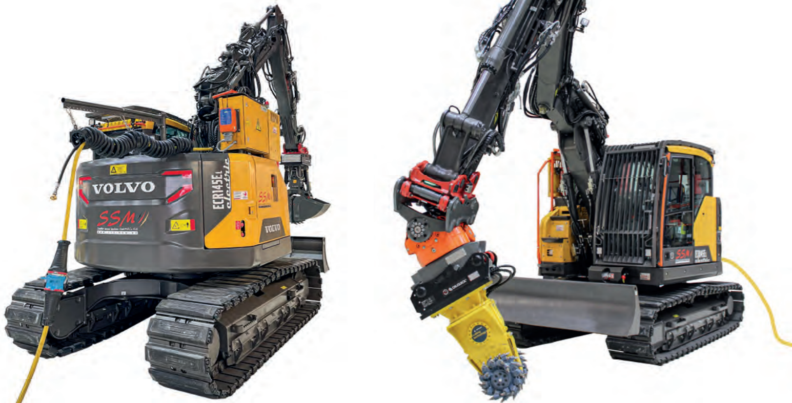
ECR145E with electric drive and radio remote control (power feed on the upper carriage)