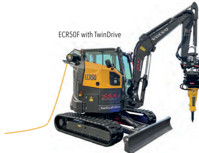
ECR50F with TwinDrive