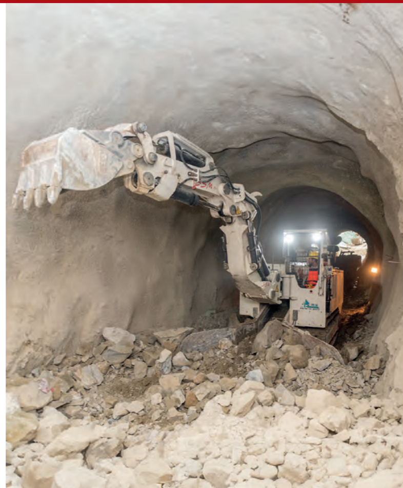
Tunnel loading machines