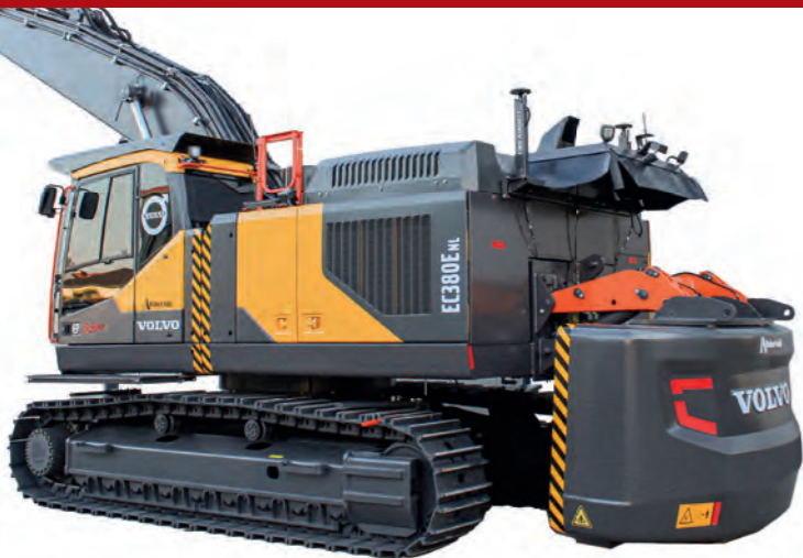
Hydraulically detachable rear counterweight