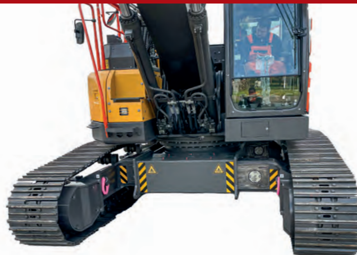
Telescopic tracked undercarriage

Schöller Special Machines is a certified Volvo SAS Partner (Special Application Solutions). With our innovative and experienced team, we specialize on Volvo-based customized machinery for extraordinary applications. This includes design, manufacture and assembly as well as documentation and CE certification.