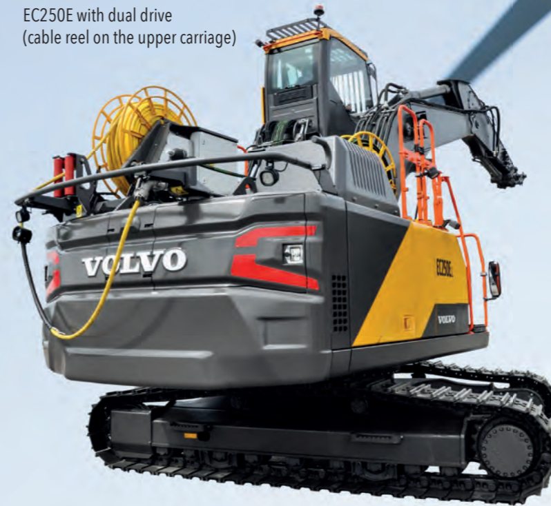
EC250E with dual drive (cable reel on the upper carriage)

In order to save resources and protect the health of the fellow workers on site, we also offer a range of electrically powered tunnel excavators and wheel loaders that allow for interruption-free operation.