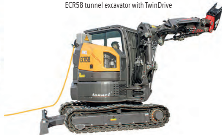
ECR58 tunnel excavator with TwinDrive