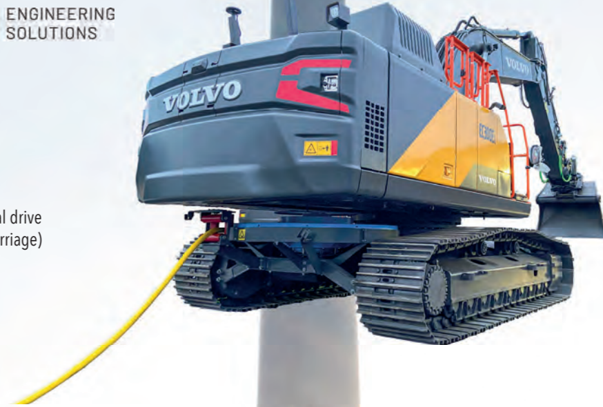
EC300E with dual drive (cable reel at the undercarriage)