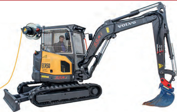
ECR50F with electric drive and radio remote control