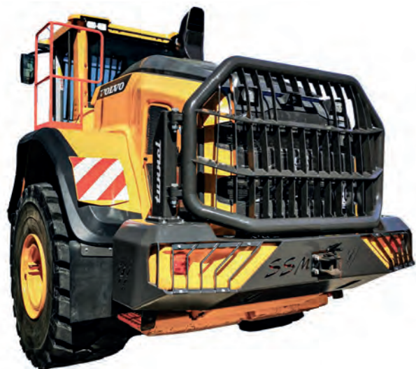
Heavy-duty ram protection